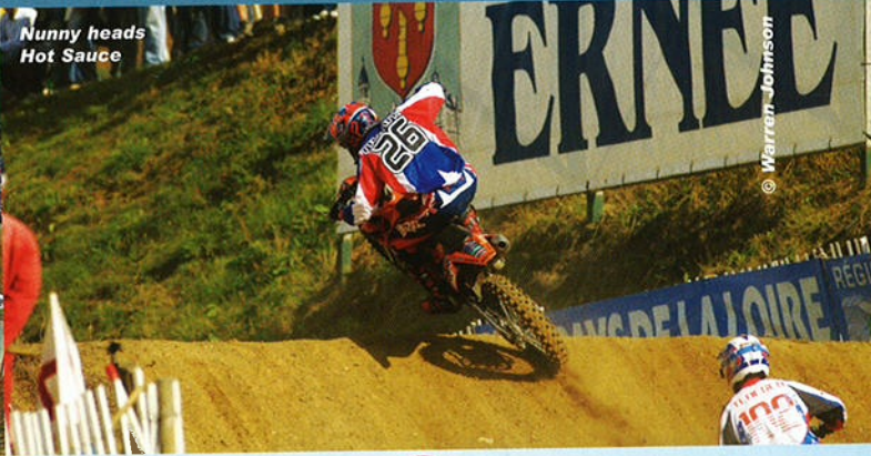
Nunny heads Hot Sauce